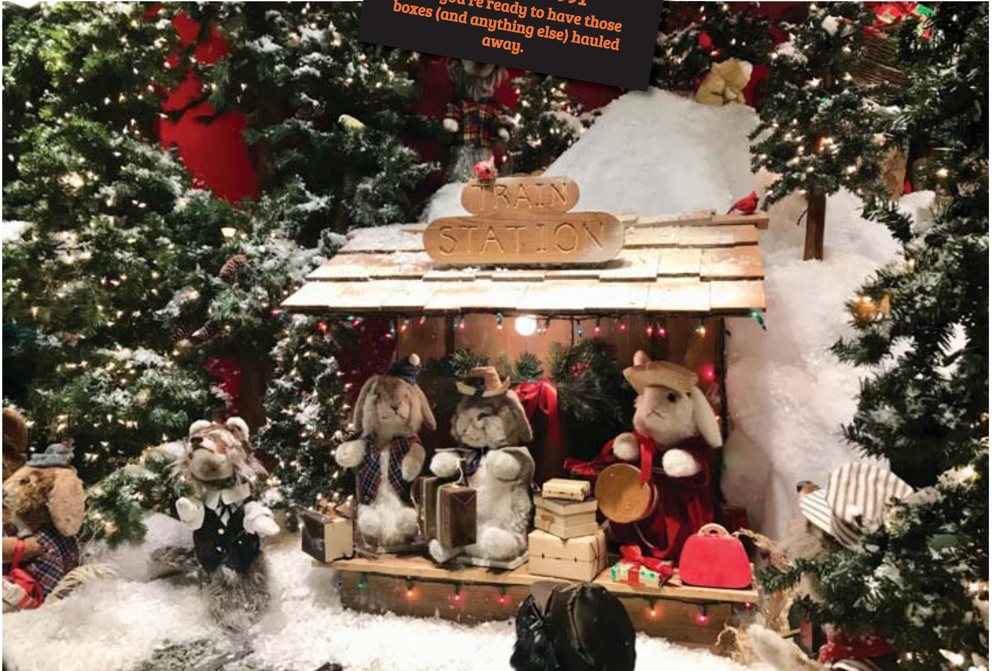
The window display at the Lafayette McCaulou's.