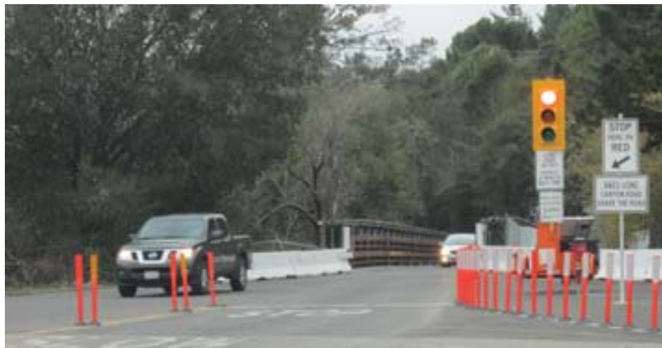
Temporary Canyon Bridge